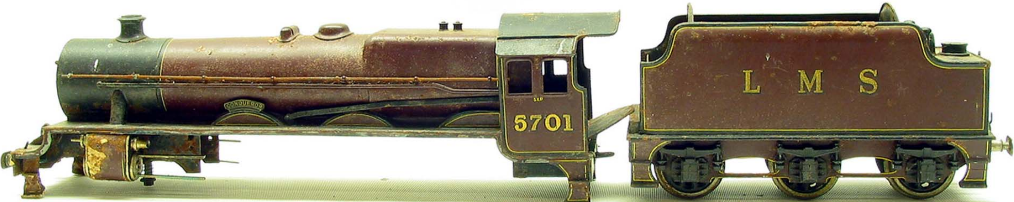
O Gauge Bassett Lowke 4-6-0 Jubilee "Conqueror" no. 5701 Electric Tender Locomotive – BEFORE RESTORATION