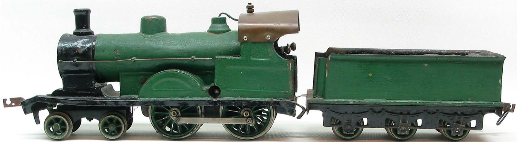
Gauge 1 Ernst Plank Clockwork LNWR 4-4-0 Tender Locomotive - BEFORE restoration